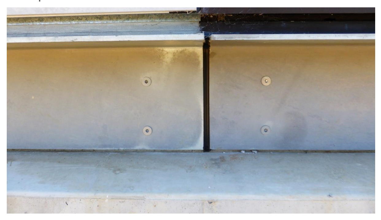
Figure 1: A dull grey appearance on some steel beams due to the chemical composition of the steel.