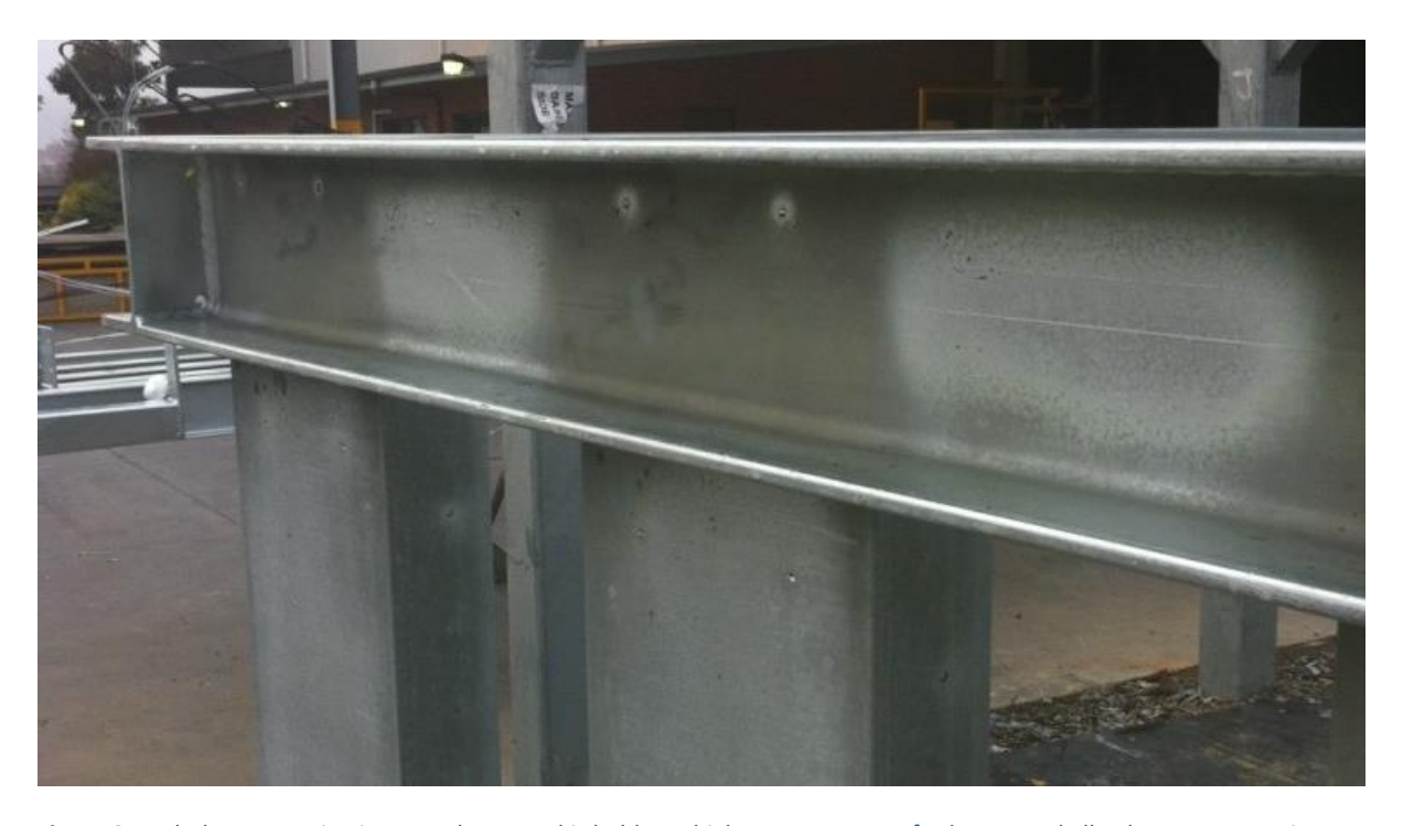
Figure 3: A dark grey coating is seen where steel is held at a higher temperature for longer and alloy layers can continue to form. More examples of both shiny and dull regions on the same article can be found in Differing Appearance .

The Galvanizers Association of Australia has made every effort to ensure that the information provided in this document is accurate, however its accuracy, reliability or completeness is not guaranteed. Any advice given, information provided or procedures recommended by GAA represent its best solutions based on its information and research, however may be based on assumptions which while reasonable, may not be applicable to all environments and potential fields of application. Due and proper consideration has been given to all information provided but no warranty is made regarding the accuracy or reliability of either the information contained in this publication or any specific recommendation made to the recipient. Comments made are of a general nature only and are not intended to be relied upon or to be used as a substitute for professional advice. GAA and its employees disclaim all liability and responsibility for any direct or indirect loss or damage which may be suffered by the recipient through relying on anything contained or omitted in this publication.