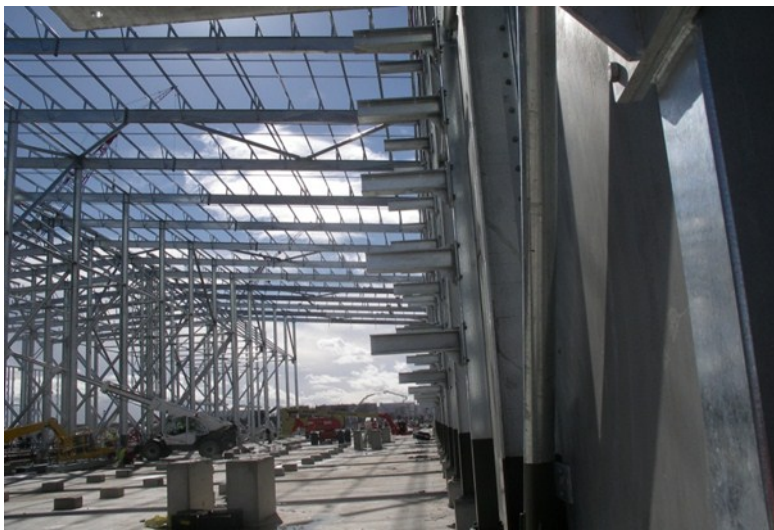
Desalination plant, Sydney during construction – the lower section of the uprights are painted to protect the surface from salt splash

Hot dip galvanizing is inherently very durable, so there will rarely be a need to paint over it to achieve the intended service life. Indeed, in higher corrosivity zones (C3 to C5) painting galvanized steel can actually accelerate corrosion of the zinc substrate and reduce the overall service life of the article from the expected galvanized-only life unless a judiciously selected, uniformly applied, high build paint system is applied and the integrity of that paint system is maintained through its service life.