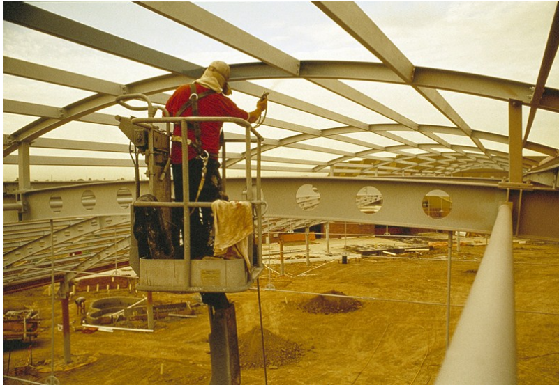
Primer being applied over galvanizing to EG Whitlam Pool frame structure in preparation for decorative coat

For painting unweathered galvanizing with conventional low build paints (see Service Requirements 1 and 2) cleaning and degreasing is normally adequate, although light scuffing with sandpaper will invariably enhance paint adhesion. For higher build paints and under conditions of more arduous wear, brush (whip) abrasive blasting is favoured (see Service Requirements 3 to 6)