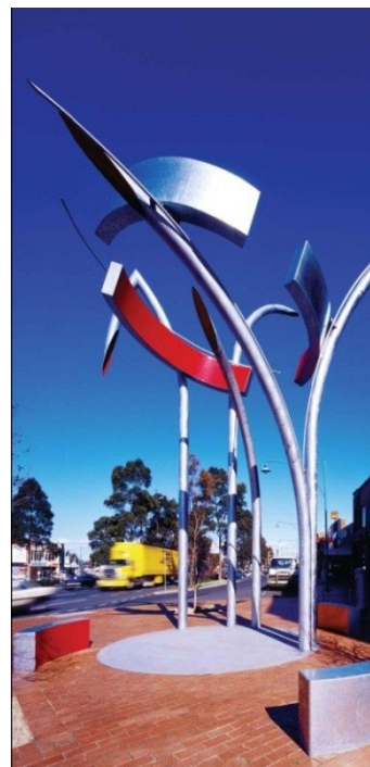
Reverie - Dandenong, Victoria

A great deal of galvanizing is painted on a casual basis, with conventional latex or suitably primed solvent-based alkyd paint 3 . Choice of this primer is crucial and requires a clear recommendation from the paint manufacturer. In particular, the use of an alkyd primer in direct contact with the galvanizing risks delamination of the paint due to its saponification.